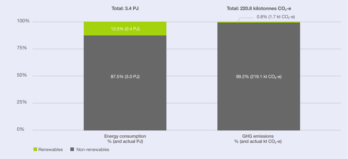
Figure 1: Process heat fuel demand and GHG emissions for the indoor cropping sector 2016 – percentages (and actuals) by energy source<sup>8</sup>

12.5% of the energy consumed was from renewable sources. This was mostly geothermal energy. Some sites have converted from using coal or gas to biomass, however their biomass energy volumes are not clearly known. Renewable energy sources accounted for less than 1% of the sector's emissions. The remaining 87.5% of energy consumption was from non-renewable sources – and accounted for almost all 99.2% of its emissions (see Figure 1).